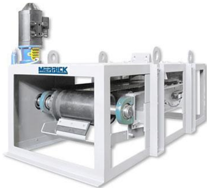
Shown with covers removed